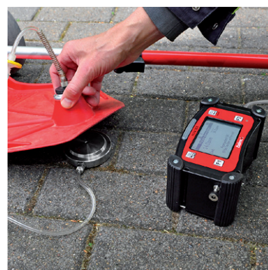
Quick gas test

(measuring range from 0 to 100 Vol.-% CH 4 and O 2 )